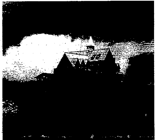
Prince of Wales Hotel, Waterton, AB

Waterton-Glacier International Peace Park straddles the Canada-USA border in the SW corner of the province. Waterton Lake, the centerpiece of Waterton National Park (the Canadian portion), straddles the border and forms the headwaters of the Waterton River, a tributary of the Oldman system, and a partial source of water for the St. Mary River Project, the four districts referred to above. Waterton National Park boasts a rich history with stories back to before 1900, and is a favorite haunt of naturalists, hikers and ordinary families looking for inner refreshment or closeness to God's creation.