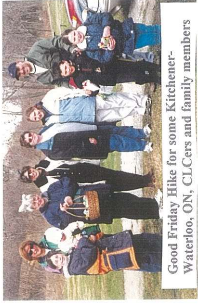
Good Friday Hike for some Kitchener-Waterloo, ON, CLCers and family members