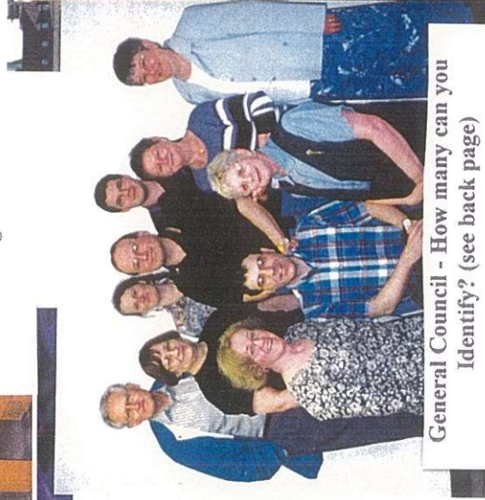
General Council - How many can you identify? (see back page)