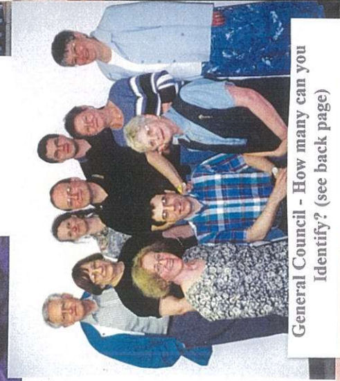
General Council - How many can you Identify? (see back page)