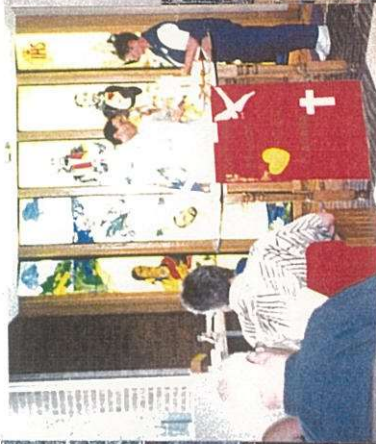
Commissioning Mass General Council St. Paul's High School, Winnipeg