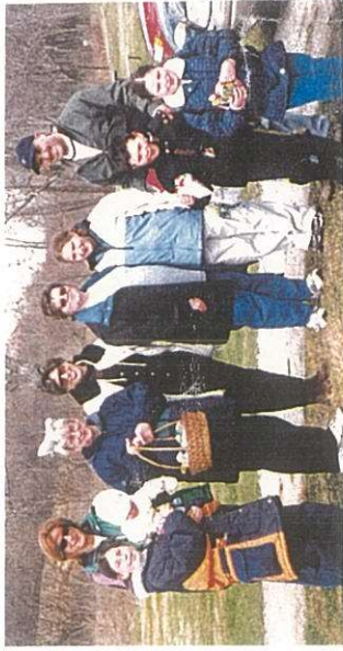
Good Friday Hike for some Kitchener-Waterloo, ON, CLCers and family members