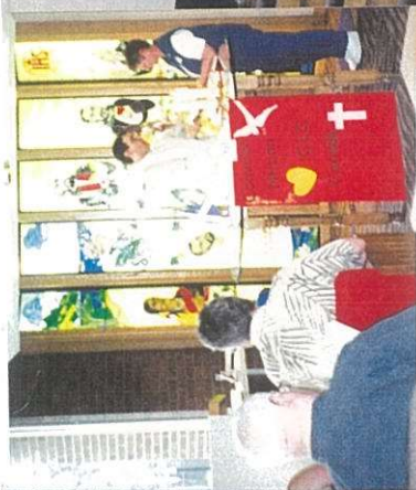
Commissioning Mass General Council St. Paul's High School, Winnipeg