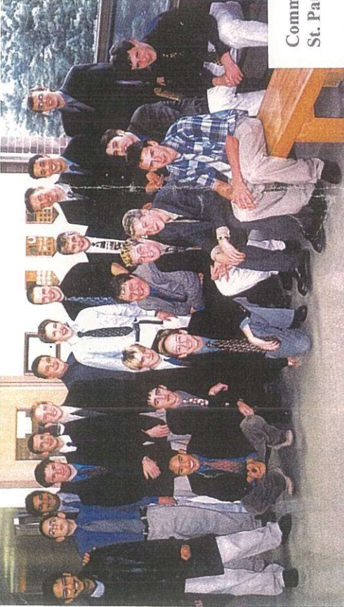
Christian Life Community - Grade 11 ST. PAUL'S HIGH SCHOOL, WINNIPEG