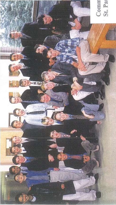
Christian Life Community - Grade 11 ST. PAUL'S HIGH SCHOOL, WINNIPEG